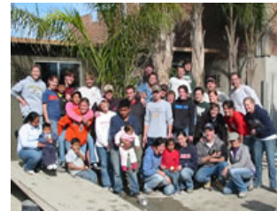
College Trip to Tijuana, Mexico - 2009